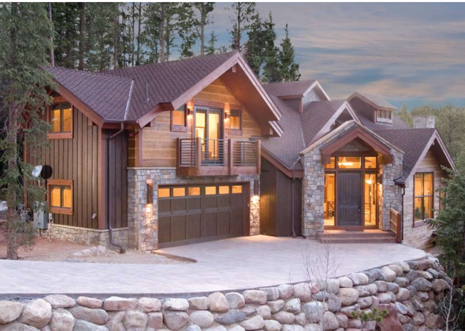
Above: The fully-furnished home features unique architectural elements, high volume ceilings and generous windows.